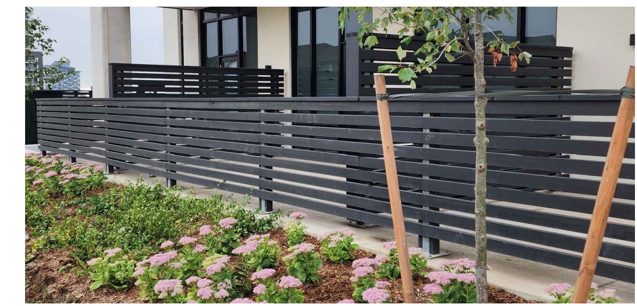
WOOD SLAT PRIVACY FENCE

CONTRACTOR SHALL CHECK ALL DIMENSIONS ON THE WORK AND REPORT ANY DISCREPANCY TO THE LANDSCAPE ARCHITECT BEFORE PROCEEDING. ALL DRAWINGS AND SPECIFICATIONS ARE THE PROPERTY OF THE LANDSCAPE ARCHITECT AND MUST BE RETURNED AT THE COMPLETION OF THE WORK. THIS DRAWING IS NOT TO BE USED FOR CONSTRUCTION UNTIL SIGNED BY THE LANDSCAPE ARCHITECT.